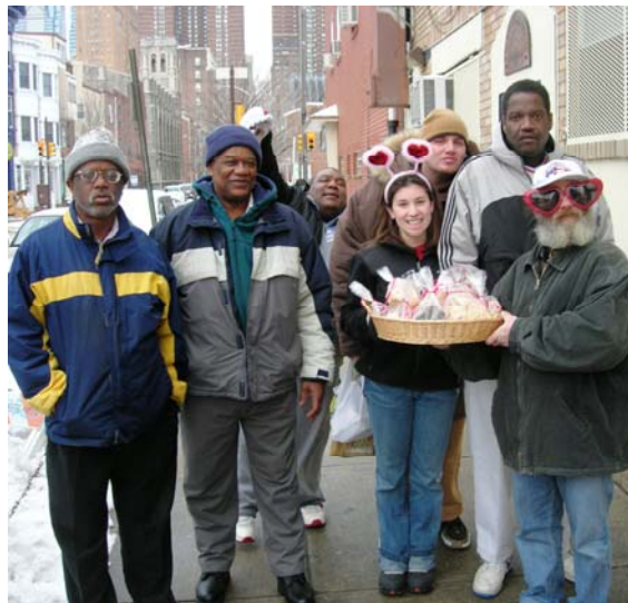
My Brothers' House staff and residents display the products of their annual Valentine's Day bake-off!

Though Valentine's Day 2007 marked some of the worst weather Philadelphia has seen all year, residents and staff at My Brothers' House brought warmth to nearby sites with friendly greetings – and lots of calories!